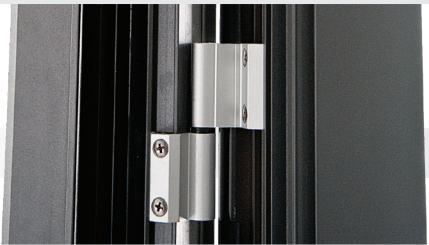
hinges with smooth operation